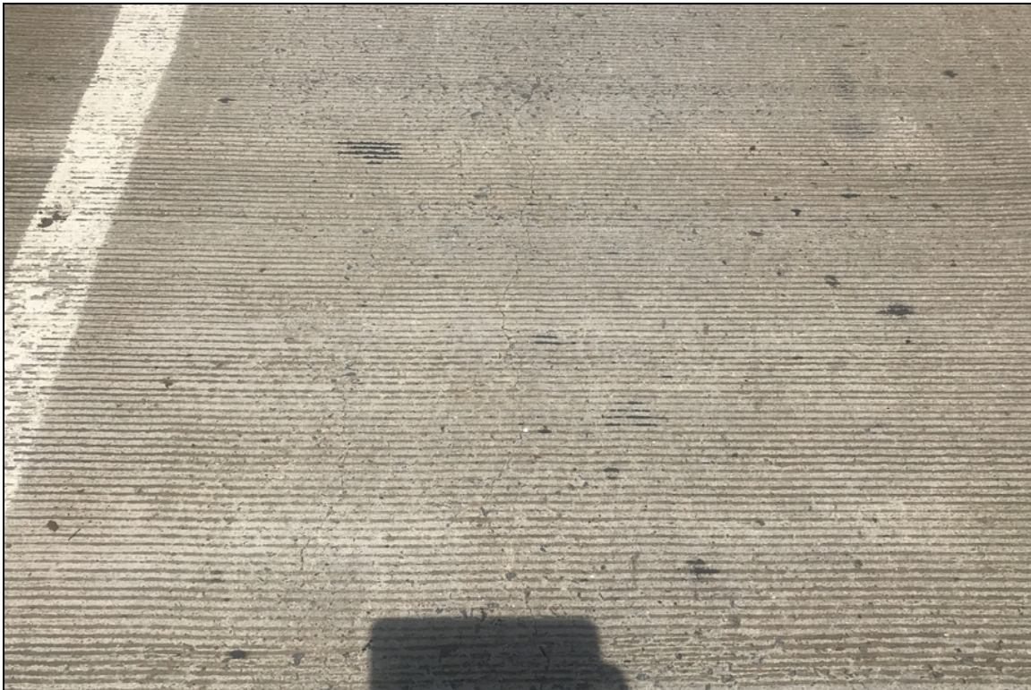
Cracks in span 1.