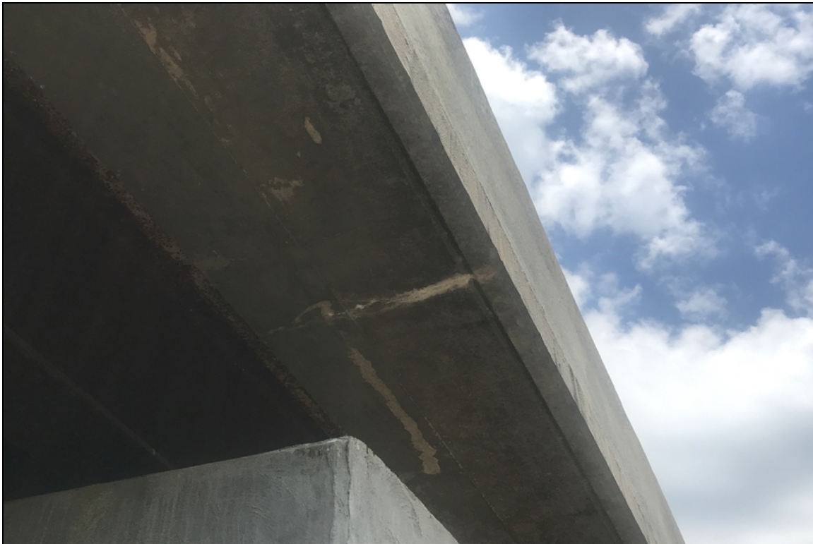
Overhang soffit cracks.